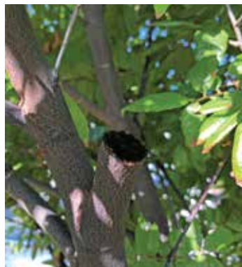
Pruning paste applied