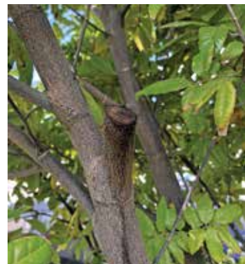
Seven months after paste applied